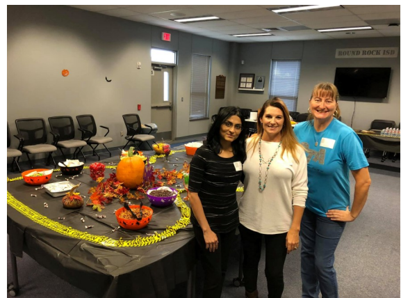
Council PTA set up a trail mix bar at the RRISD Administration office to show gratitude for all they do for our students.

in a world where you can be anything. BE KIND.